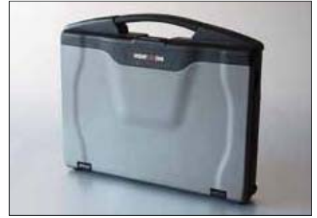
Sturdy housing with handle